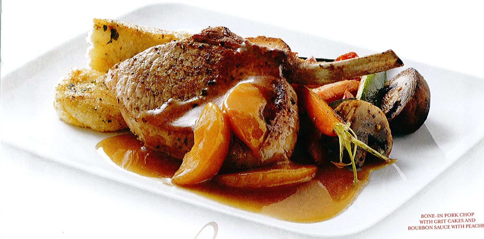
BONE-IN PORK CHOP WITH GRIT CAKES AND BOURBON SAUCE WITH PEACHES

The pride of the artisan. The joy of the palate.