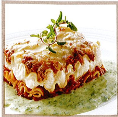
RICOTTA LASAGNA FEATURING BELLAVITANO™ CHEESE