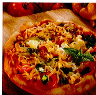
Breads & Pizza Crusts