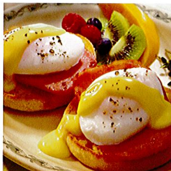
Sauces & Roux