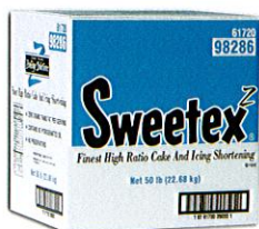
CAKE AND ICING SHORTENING

All of our Bakery Z Products are Kosher Certified ©