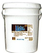
FLUID CAKE SHORTENING